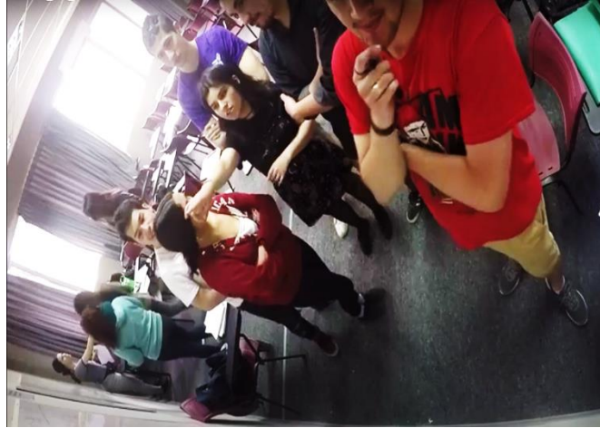
Fig. 2. Ask: The teacher intervenes in the conversation asking for explanations or clarifications about the students' work on the blackboard.